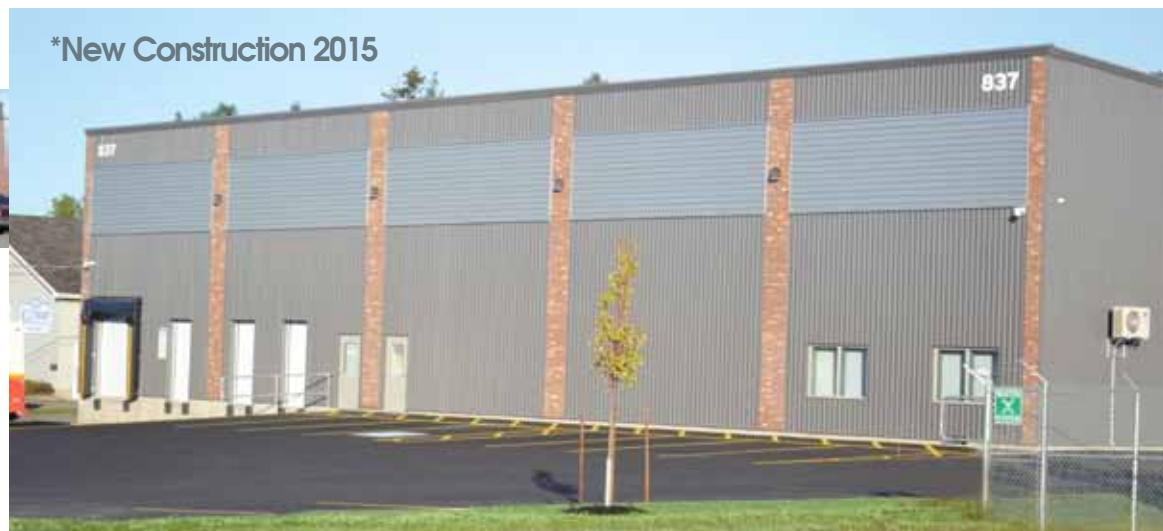
*New Construction 2015

Broadway Place Ltd has been in the property ownership/management business since 1976. We currently own over 380,000 sqft of building space throughout New Brunswick. Our clients include the Province of New Brunswick, Government of Canada, Shoppers Drug Mart, Schneider Electric and Loomis. Some of our buildings in Dieppe include 323 Champlain & 105 Englehart. In Moncton, we own 555 & 535 Edinburgh Drive.