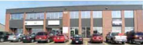
Existing Front building